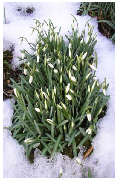
The snowdrops fighting their way through the snow