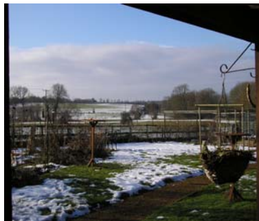
Our garden as the snow starts to clear