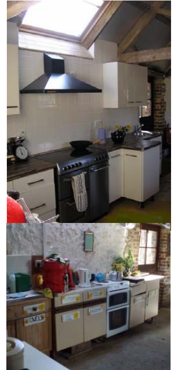
Top, new kitchen; bottom old.

Much appreciated funding also came from Vale of the White Horse District Council and the parish councils of Steventon, Kennington, Drayton, Blewbury, Shellingford, Watchfield, Buckland and Grove.