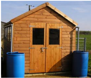
At the moment our hive of bees is being looked after for us by