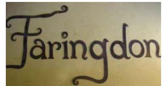
The finished lettering

The edges of the letters were forged to their final shape before being welded together into the larger letters.