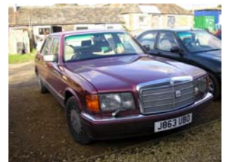
Jim's classic Mercedes

Then there is Claire who has created a beautiful blog that often receives more than 100 visitors a day.