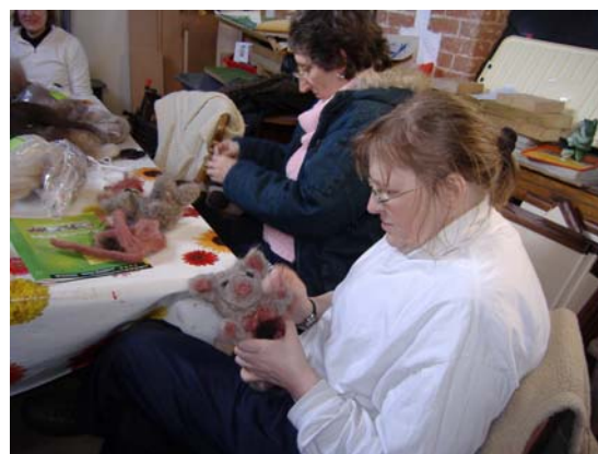
Dry Felting Workshop

Yoga classes throughout March Stalls at Faringdon and Wantage Farmer's Markets Wood turning workshops in April New wood working projects in our new workshop Espalier tree sculpture made from metal Pottery every Wednesday Bee keeping every day We have a new Wormery—learn how to look after a wormery Creative Writing workshops with Kim Make and Install a New Kitchen Wellness Recovery Action Plan meetings every month Music workshops in the summer